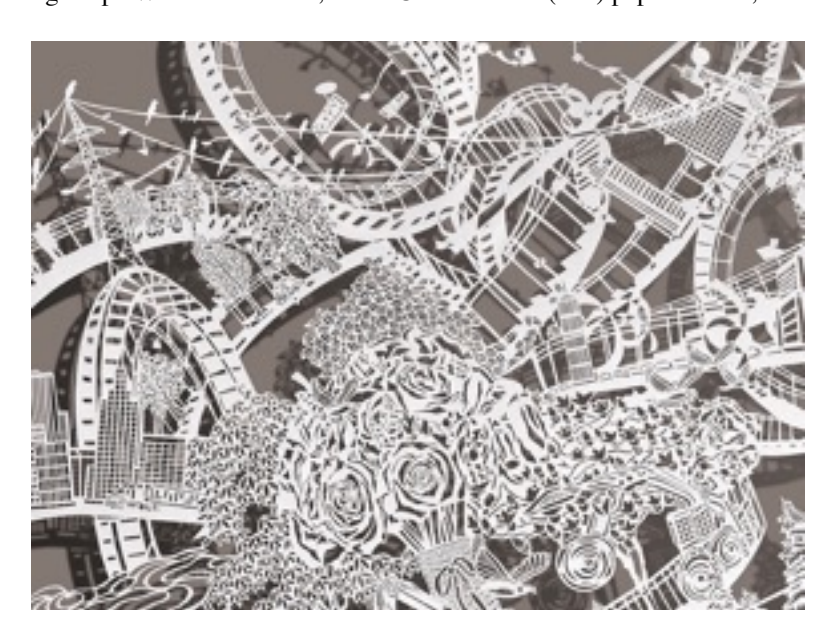
The Tightrope Walker, detail