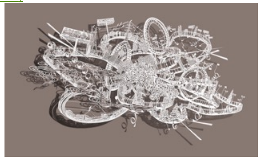
The Tightrope Walker 50×27.5", 2015. Chinese xuan (rice) paper on silk, hand cut.

Many of these pieces will be on view starting next week at <u>Gavlak Gallery</u> for her show titled Divertical (a name taken from the world's tallest water rollercoaster) starting January 9th. What you see here is just a fraction of her latest art, see plenty more in her <u>2015 gallery</u>.