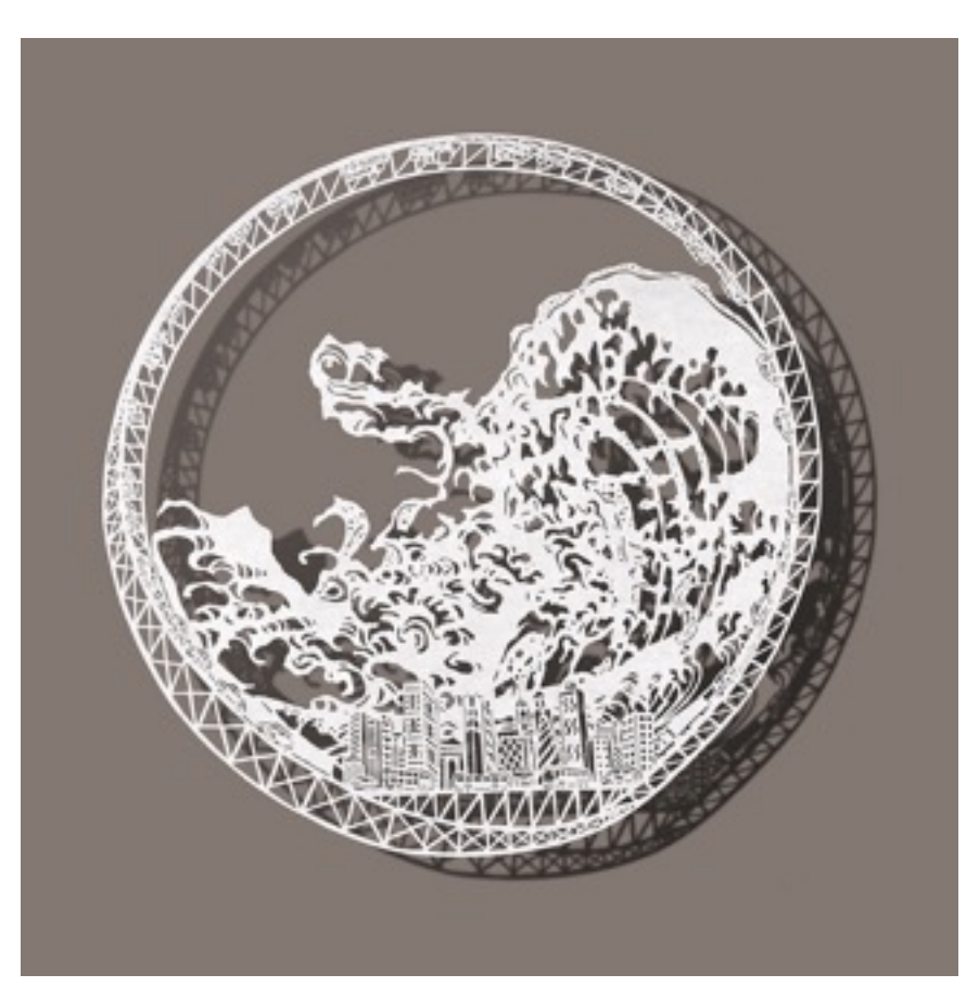
Ring-The Big Wave Surfer 12×12", 2015. Chinese xuan (rice) paper on silk, hand cut.