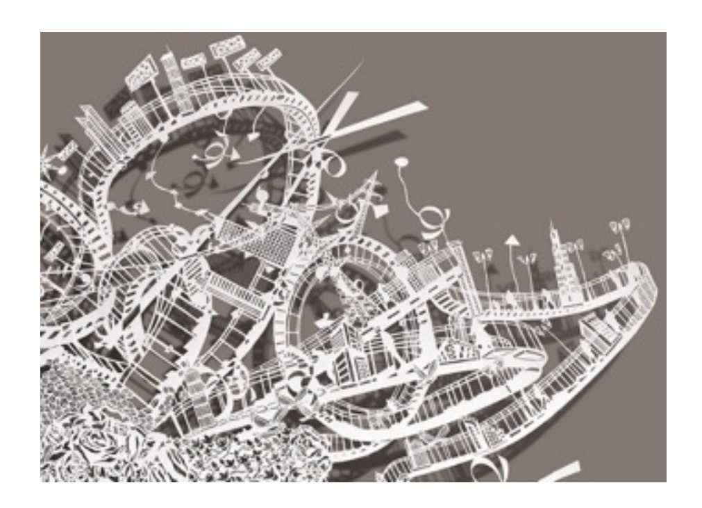
The Tightrope Walker, detail