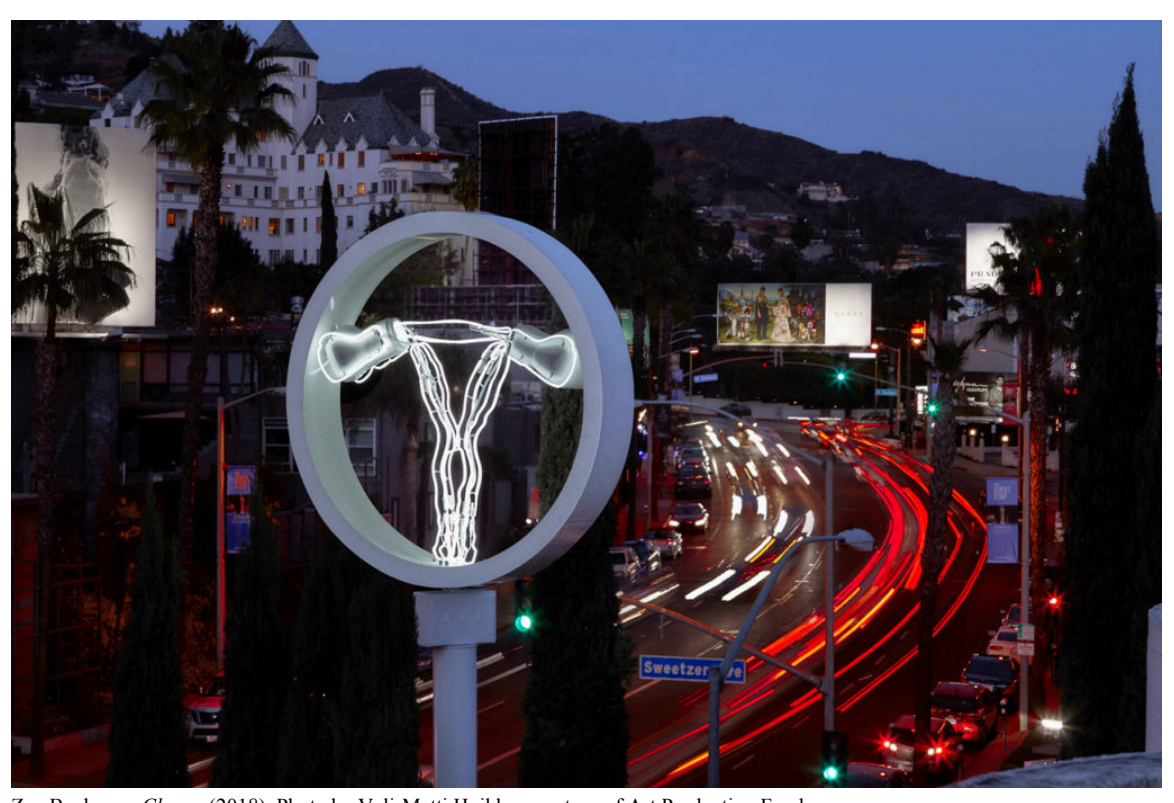
Zoe Buckman, Champ (2018).

An in-your-face reminder of the women's movement and its newfound ability to topple men in positions of power has risen in Los Angeles. <u>Zoe Buckman</u>'s <u>Champ</u>, a glowing neon pair of ovaries clad in boxing gloves, stands 43 feet tall outside of the Standard, Hollywood, overlooking Sunset Boulevard.