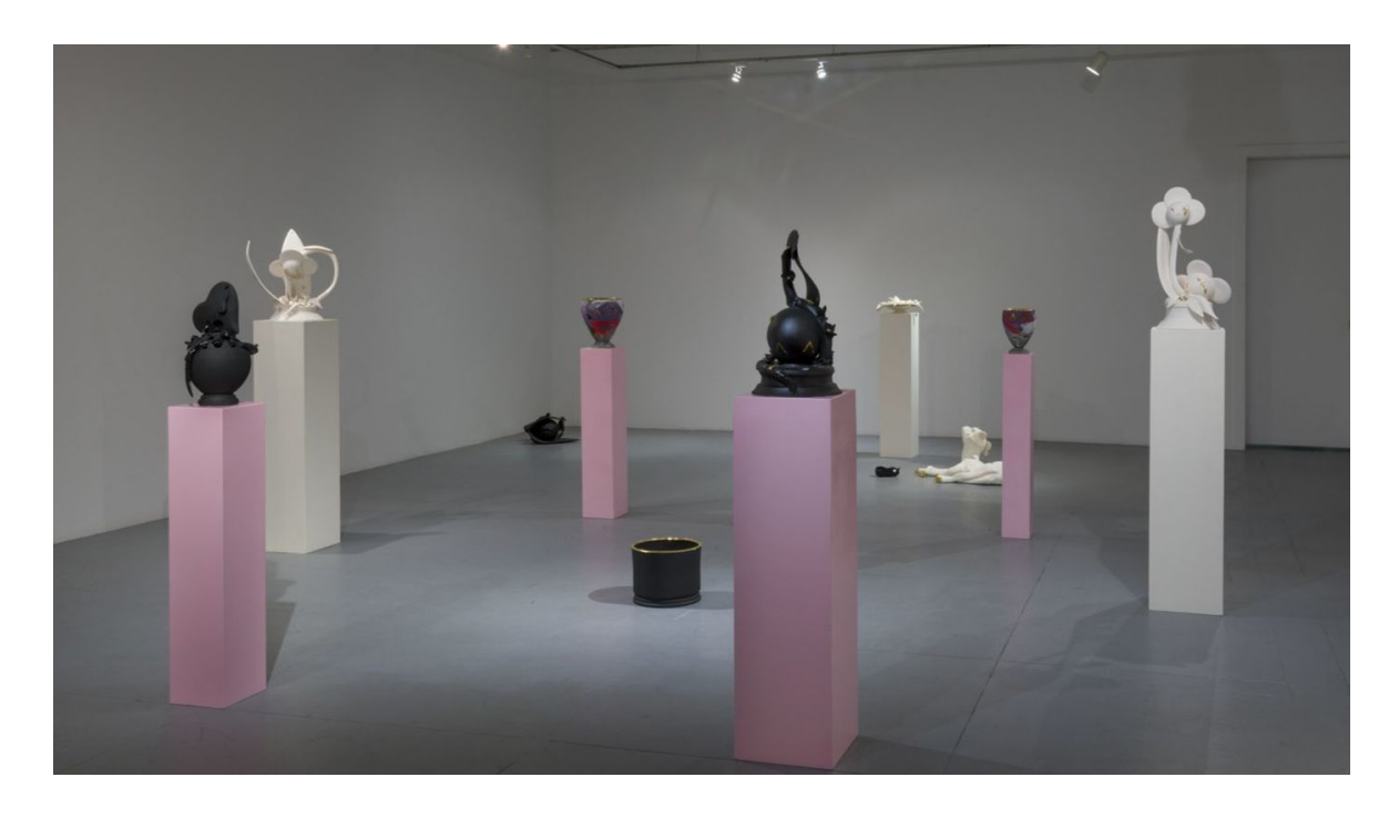
Installation view of Alex Anderson's "Wonderland" at Gavlak.